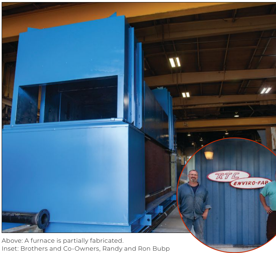
Above: A furnace is partially fabricated.